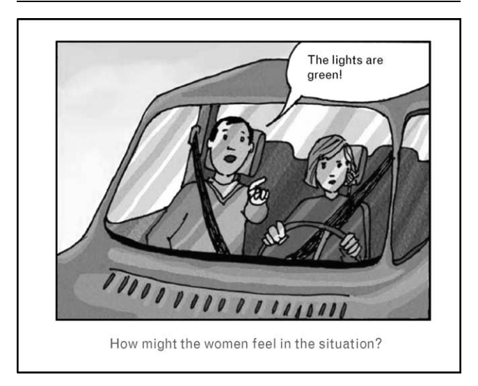
Figure 3 Exercise from module 6

Multiple responses are possible, which is unsatisfactory for patients with a need for closure (e.g. the woman may take the man's words as a mere comment, patronizing behaviour or a command). ('untitled' by Martin Armbruster).